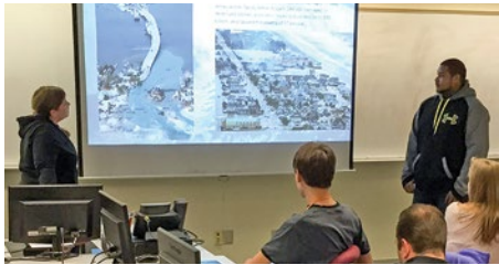
MCC students present their project on hurricane damage assessment to their peers and EagleView Pictometry International employees.

MCC already offered courses in GIS before efforts to develop a certificate program got underway. MCC