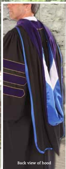
Back view of hood