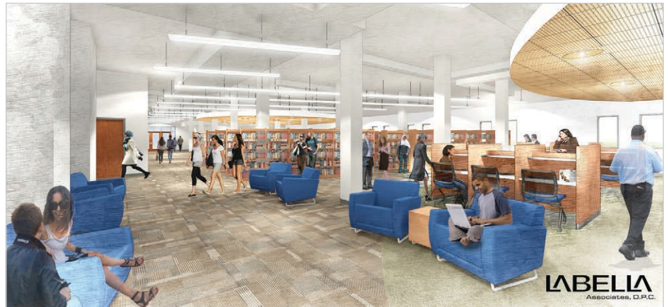
The learning commons will combine library, computer lab and tutoring space. (Concept designs may evolve. Architectural rendering provided by LaBella Associates, DPC.)