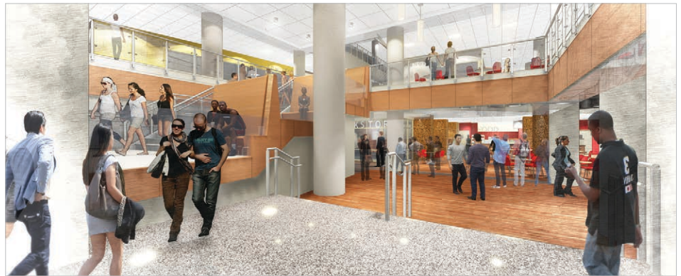
The first-floor lobby will create a vibrant and welcoming environment for current students, prospective students and the community. (Concept designs may evolve. Architectural rendering provided by LaBella Associates, DPC.)

LaBella's latest renderings for the new downtown campus illustrate learning spaces that will be flexible, allow for integrated computer technology and provide a wide range of audio, visual and data capabilities. Distinct features of the design include an open stairway connecting the first three floors with public space that provides invaluable opportunities for commuter students to gather to study and work collaboratively.