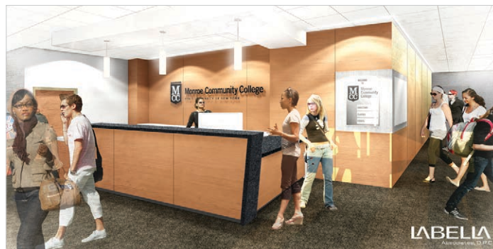
A concierge desk at the Morrie Silver Way entrance welcomes and provides information to students and guests. (Concept designs may evolve.)