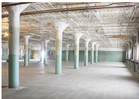
Walls, ductwork, ceiling, and carpet have been removed and asbestos abatement has been completed on the sixth floor to prepare for main construction.

The process for requesting construction bids on the remaining work on the project will begin soon. Design plans and other necessary documents will be submitted to the county by early May, and the county's selection of contractors for Phase 2 will happen by fall.