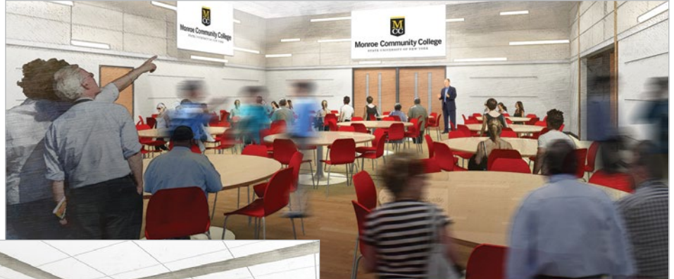
Modern meeting/function space will significantly increase and enhance events that can be held on campus for the college and local community. (Concept designs may evolve. Architectural renderings provided by LaBella Associates, DPC.)