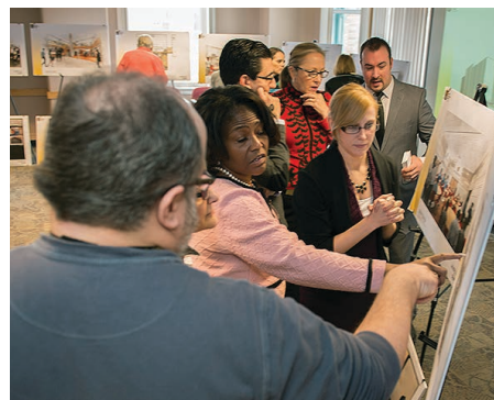
MCC faculty and staff get a close-up view of the latest architectural renderings provided by LaBella Associates at a Damon City Campus presentation.