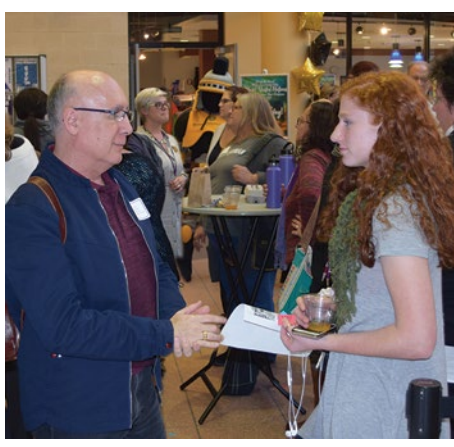
Meet and greet events hosted by the Schools @ MCC help students connect with faculty and peers with similar academic and career interests.

Since the launch of the Schools in September 2016, more students have chosen to take more courses and earn more relevant college credits. Working in conjunction with the Community College Research Center and the