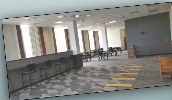
Student Services Renovation and Relocation of Departments