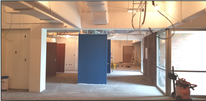
Bldg. 7 Biology Lab Renovation and New Testing Area