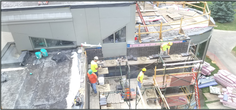
Building 11 Roof Replacement Project