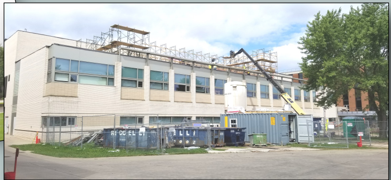
Building 11 Façade Replacement Project