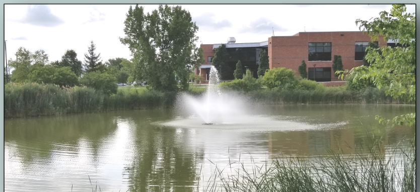
Pond Aerator Project