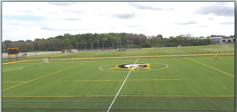
DiMarco Turf Field Replacement