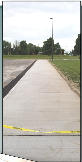
Concrete Sidewalk Replacement Project