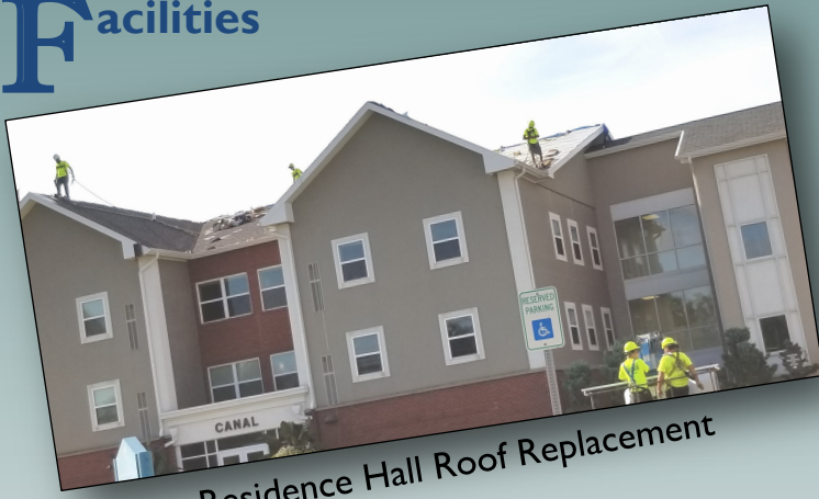
Residence Hall Roof Replacement