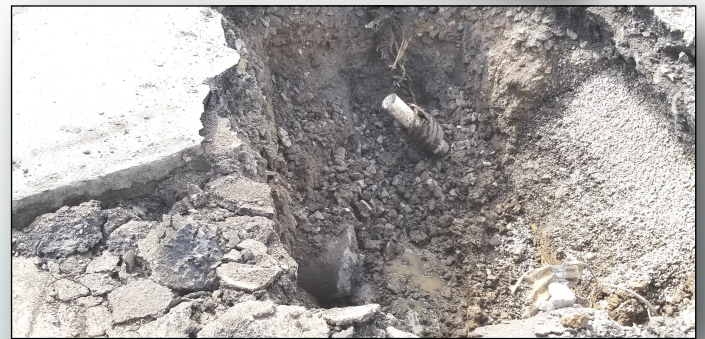
Site Drainage Catch Basin Repair Project