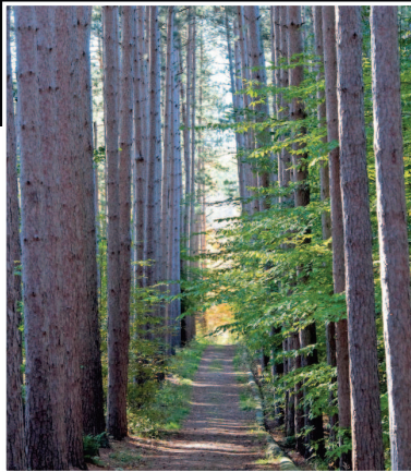
The Rochester Museum and Science Center's Cumming Nature Center in Naples, Ontario County.

The Rochester Museum and Science Center's Cumming Nature Center and the Naples Library will host a free book discussion about Peter Wohlleben's "The Hidden Life of Trees" at 11 a.m. Wednesday, May 6. This event is part of the museum's Online Eco-Book Club and Hike, which is typically held each month in person. Advanced registration is required via bit.ly/EcoBookClubandHike . All who register will be sent instructions via email on how to participate virtually.