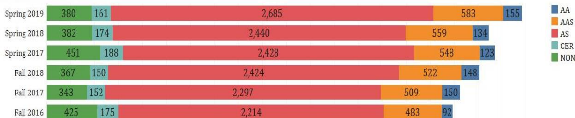
Figure 1. Online Enrollment by Credential Type

All Online students are generally age 25 or older, female, residing outside of Monroe County, and not students of color.