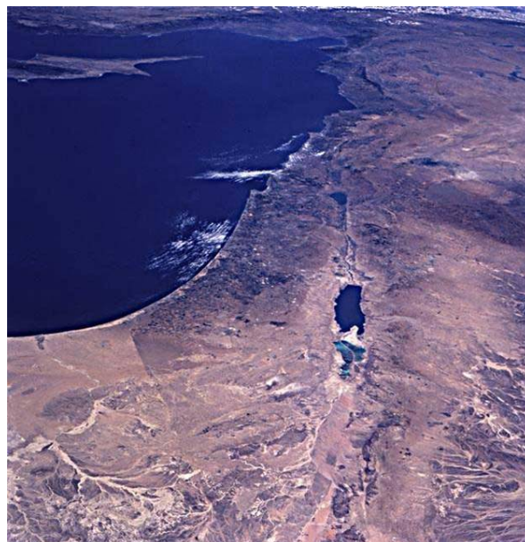
Israel – Satellite View

Day 13. Sunday, 11 June Flight back home. Arrival on the same day.