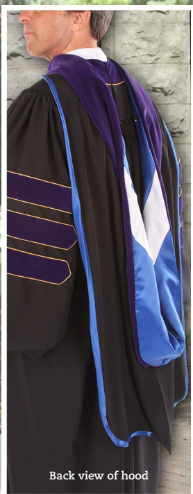
Back view of hood

HERFF JONES® A Varsity ACHIEVEMENT Brand