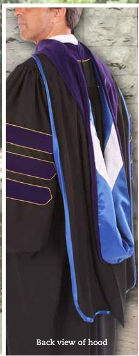
Back view of hood