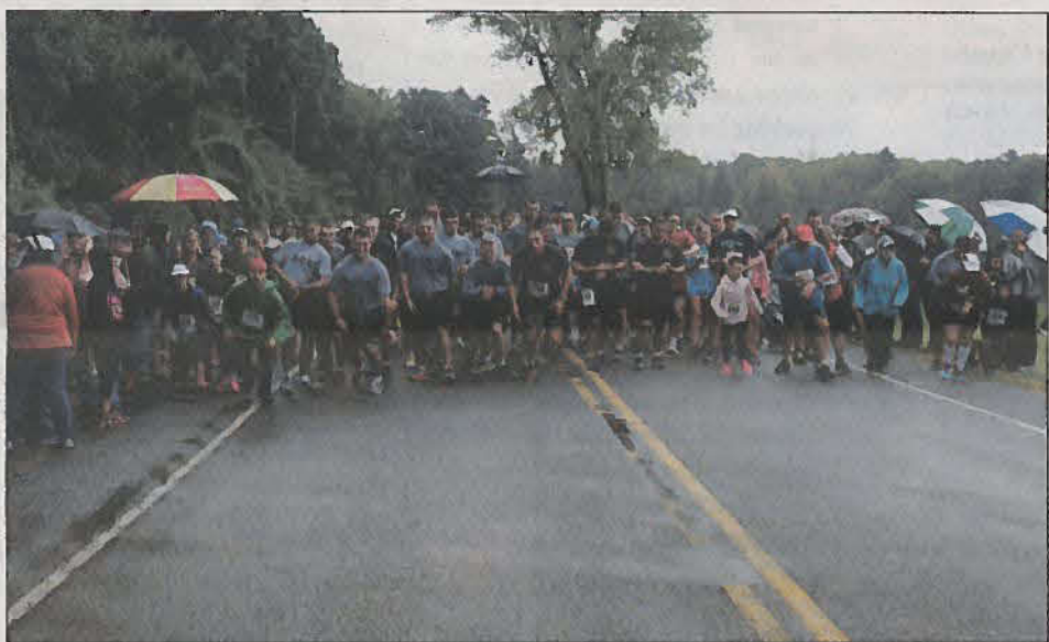
Pound the Ground, a 10K/5K race that raises funds for the Veterans Outreach Center of Rochester.