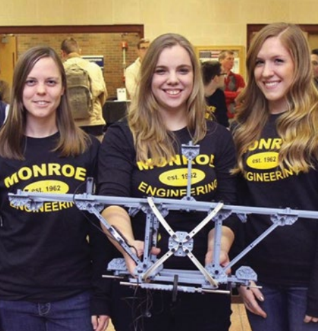
MCC has unique dual-admission agreements with 27 four-year institutions, including many SUNY colleges.