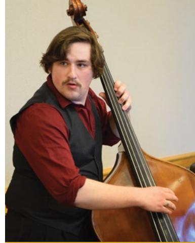
Percentage of 2014 Monroe County high school graduates enrolled at MCC: 23%.