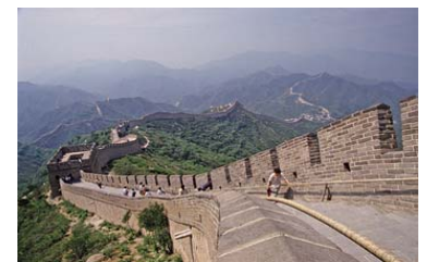
The Great Wall