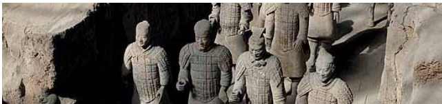
Terra-cotta Warriors, Xi'an