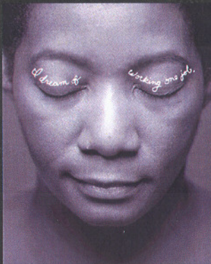
doesn't have to be a dream.