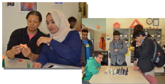
The RAFMLC has hosted Mathematics Appreciation Month events in April, such as Origami Day and Games Day.

Students say they like office hours in the RAFMLC because of the convenient location between classes and they have space to continue working while waiting to see their professor. These instructors say they like to spend time in the RAFMLC to encourage interaction with their students. They believe that some students may simply feel more comfortable seeking extra help from them here rather than in a more formal setting.