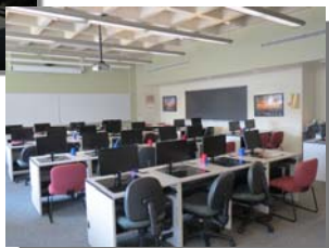
11-202 - RAFMLC Computer Classroom