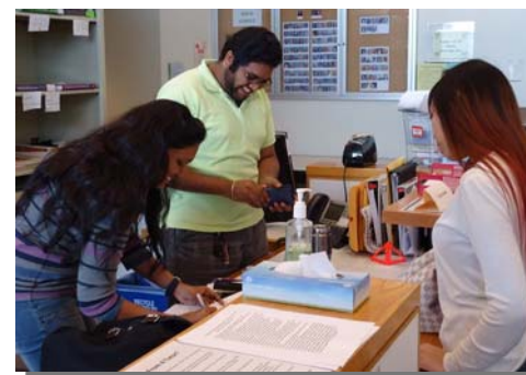
Student aides assisting students at the front desk.