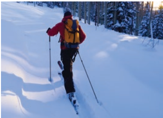
Downhill and cross-country skiing are popular in the region.