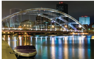
The Anthony/Douglas Bridge over the Genesee River frames Rochester's skyline.