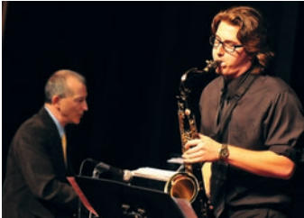
Members of the MCC Jazz Band perform at the Xerox Rochester International Jazz Festival.