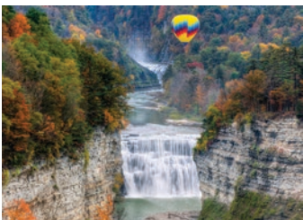
Middle Falls at Letchworth State Park in New York was voted the No. 1 state park in the country in a recent USA Today poll.