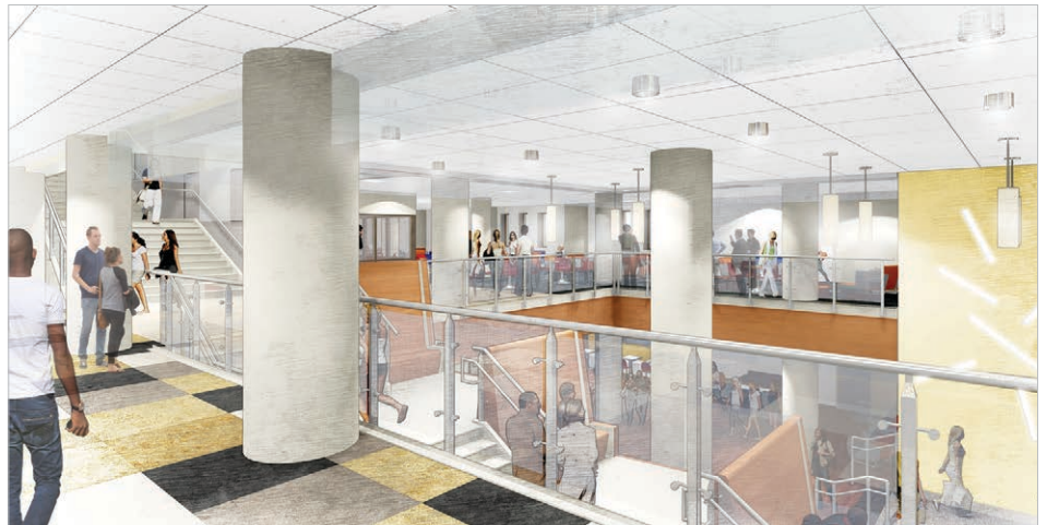
An open stairway connecting the first three floors will create an energetic, welcoming environment and allow for easy access to services and amenities. (Concept designs may evolve. Architectural rendering provided by LaBella Associates, DPC.)