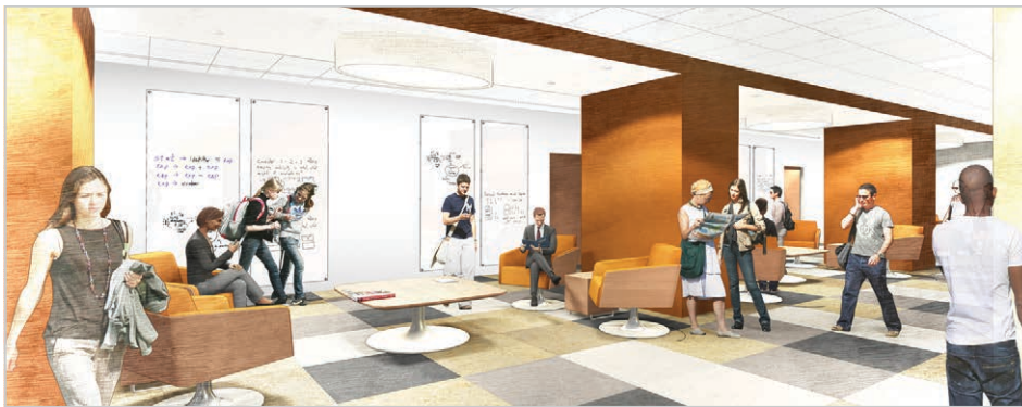
◀ Open spaces provide opportunities for students to gather to study and work collaboratively. (Concept designs may evolve.)