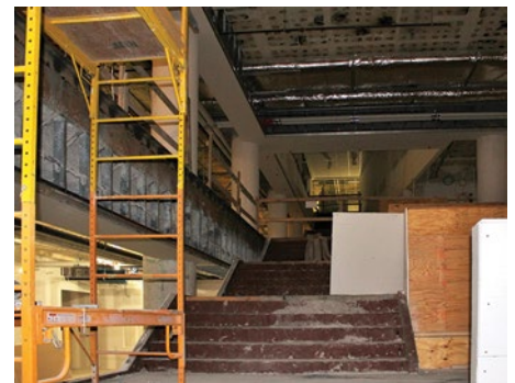
An open stairway connects the first three floors.