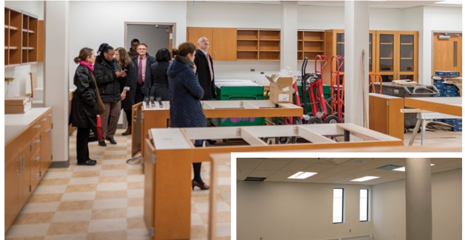
MCC's Instructional Services staff, above, visit a nearly finished science laboratory on the sixth floor of the Downtown Campus in fall 2016.

Excitement about the opening of the campus is growing. In addition to sharing project updates, MCC has provided guided tours of selected parts of the building to MCC student leaders, employees and community partners to show the project's progress. In 2016, MCC led 16 building tours for more than