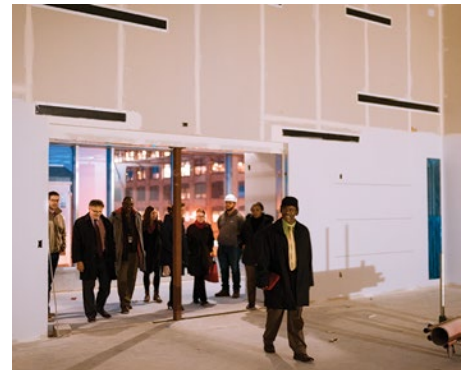
MCC faculty and staff enter what will be space for hosting events.