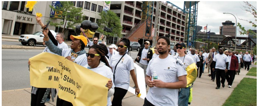
More than 100 MCC students, faculty, staff and supporters walk through downtown Rochester to MCC's new Downtown Campus on May 19, the last day of classes, marking the beginning of a new chapter in the College's history.