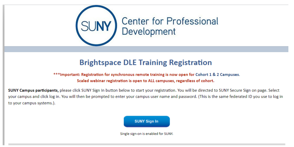
Figure 1. To register for training, use your MCC credentials

There are currently <u>two</u> options for the complete Brightspace training - synchronous sessions and session recordings. SUNY offers training as synchronous sessions, either in <u>two four-hour</u> blocks or <u>four two-hour</u> blocks. In order to participate in the synchronous sessions, you will need to <u>register</u> to see the upcoming dates and times of the synchronous training (times are available under both the "Spark" and "Ignite" headings, so feel free to browse both to find times that work with your schedule).